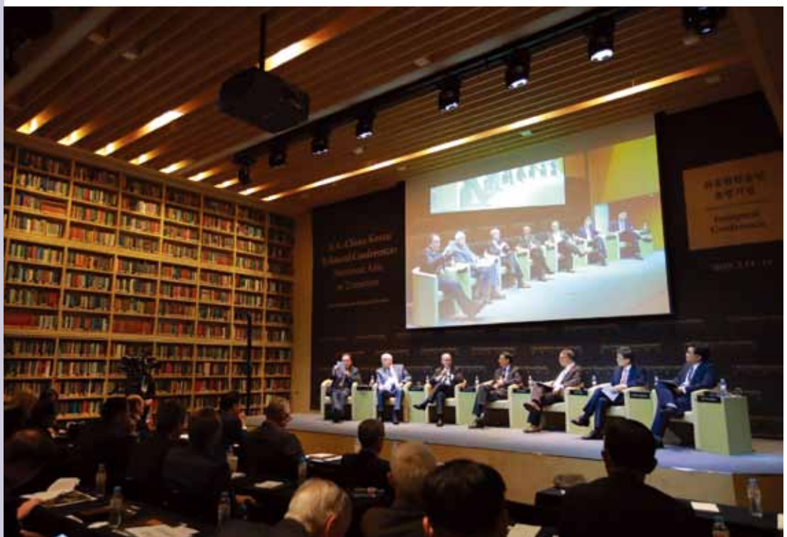
ROK-US-China Trilateral Conference

The Chey Institute supports the following international academic exchange programs.