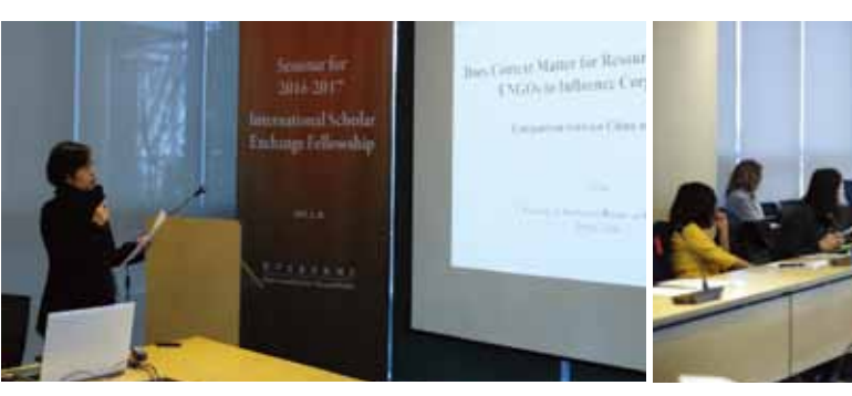
ISEF Academic Seminars