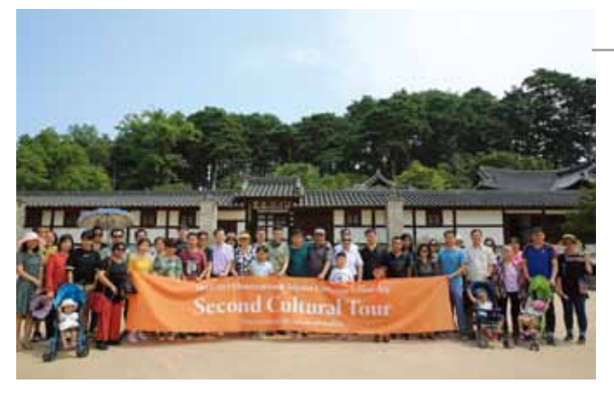
ISEE Curtural Tou

Asia Research Center 144 Xuan Thuy Road, Cau Giay District, Hanoi, Vietnam T. 84-24-3754-7670 (ext. 723) E. arc@vnu.edu.vn