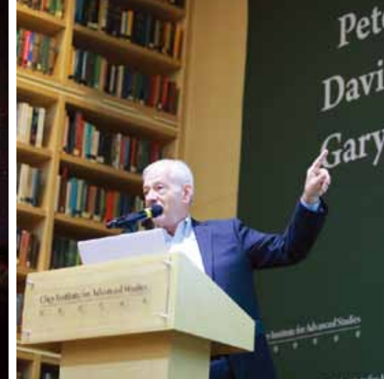
Scientific Innovation Conference