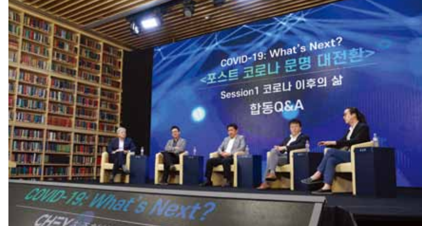
COVID19 Special Webinar Series

· Applicants must submit 2 recommendation letters. Applicants may send requests for recommendation letters on